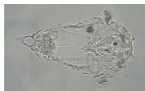
Synchaeta , a rotifer (X200)

lakes (Duggan et al. 2001, Hydrobiologia 446/447: 155-164). Bioindicator schemes rely on fewer samples needing collection than traditional methods, as species provide a reflection of environmental conditions through time. As such, the Regional Councils are finding the rotifer bioindicator particularly useful for inferring the trophic states of lakes that cannot be sampled regularly (Duggan, 2008). The technique is a score based system where common rotifer species are assigned a TLI value based on their occurrence and abundance across the trophic state gradient for lakes.